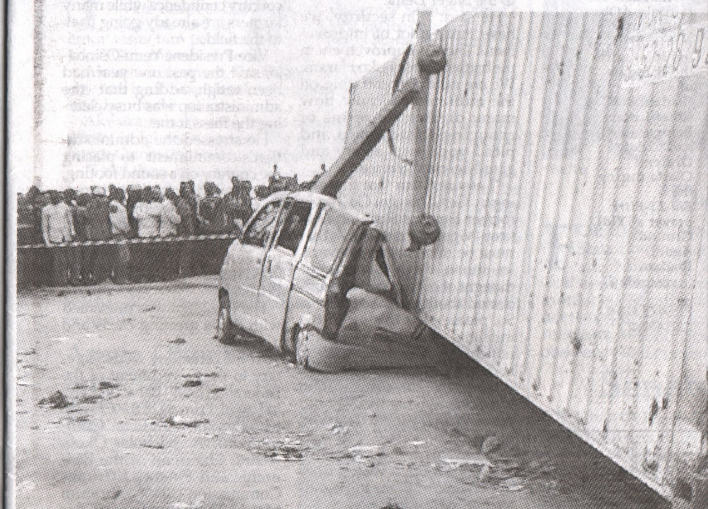
•The crushed bus under container...yesterday

"Trailer owners and drivers are advised to ensure proper checks and road worthiness on their trucks. They should also drive within the approved speed limits."