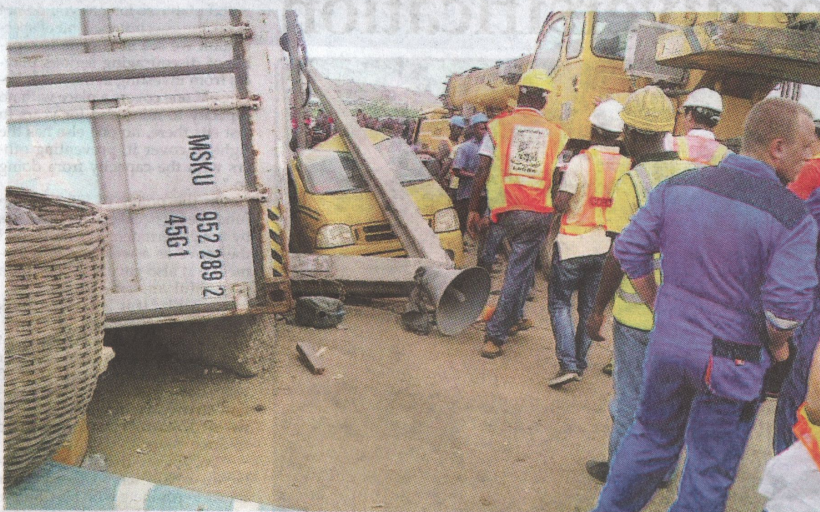
•The scene of the accident... yesterday