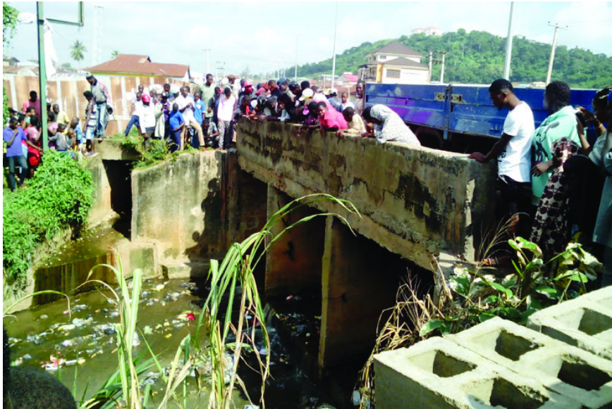
• Residents at the canal

Posted By: Odunayo Ogunmola on: June 26, 2016 In: Featured, News 2 Comments