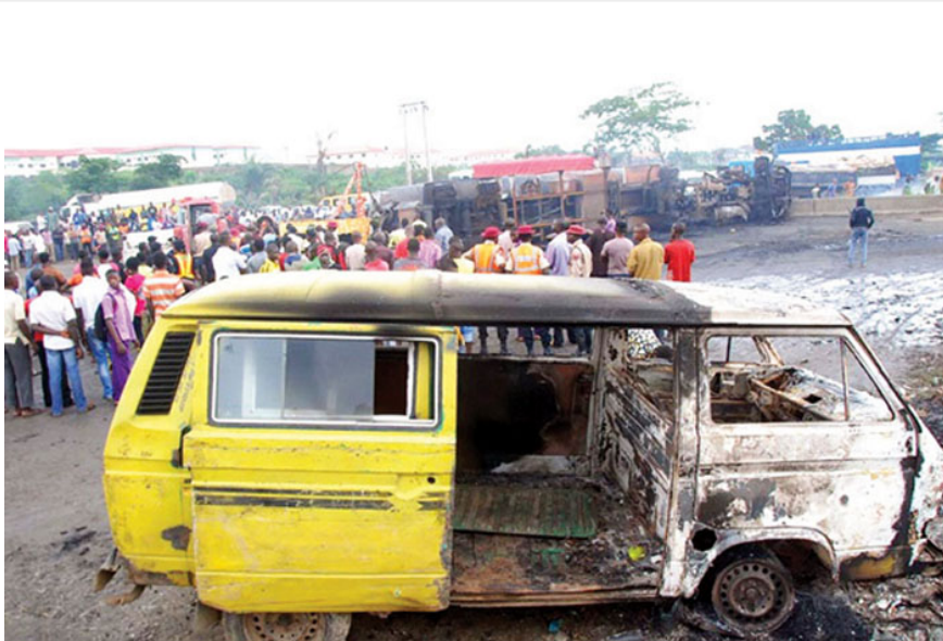
One of the burnt vehicles... yesterday

Posted By: Precious Igbonwelundu on: June 23, 2016 In: City Beats No Comments