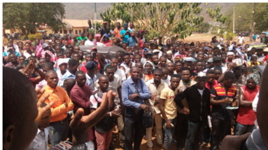
•A crowd of the polytechnic students being addressed by the Rector