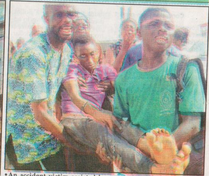
•An accident victim assisted by sympathisers at Abule-Egba... yesterday.

"Some people told us that the truck driver had hit someone at Anthony Bus Stop earlier on before killing two