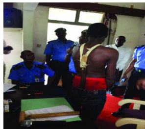
•He is accused of concealing a machete

Archive 4 (articles between April 2011 and September 20, 2012)