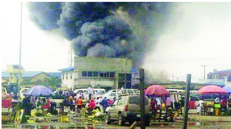
•The scene of the Ajah market inferno...yesterday