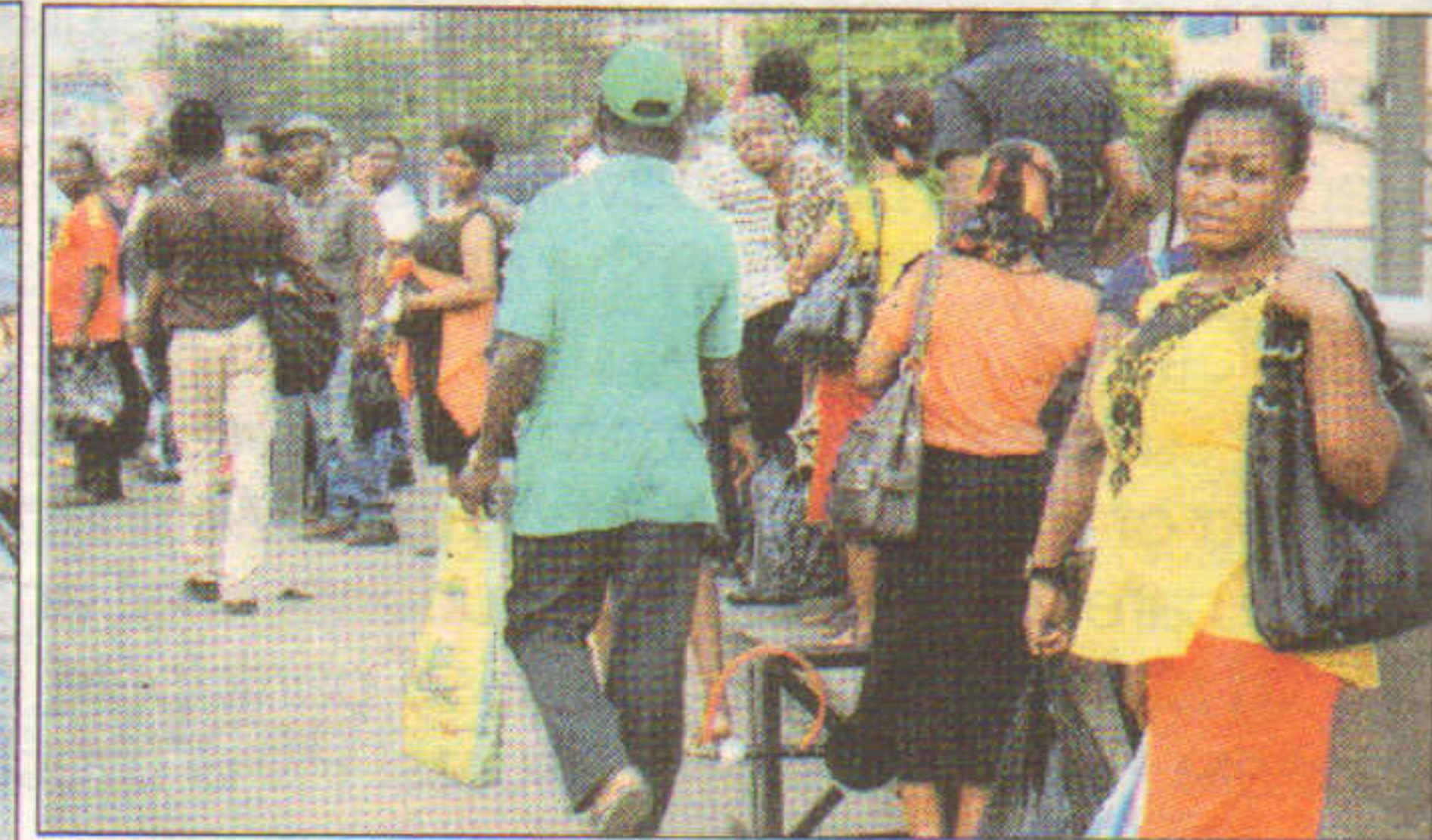
•Passengers waiting for buses at Oshodi...yesterday