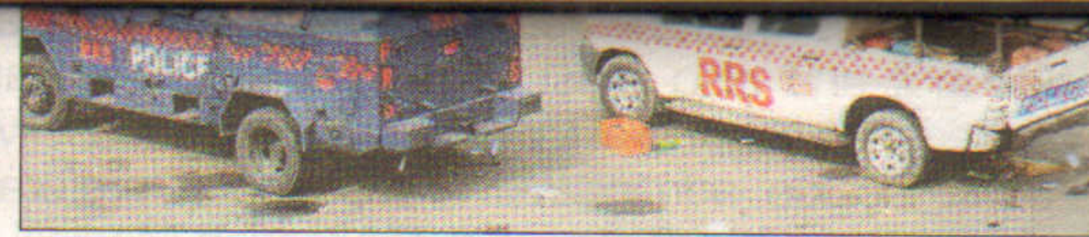
•Police vehicles stationed at Oshodi...yesterday