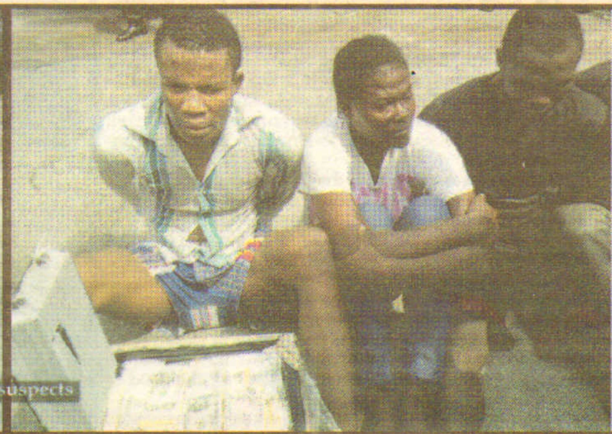
* The suspects