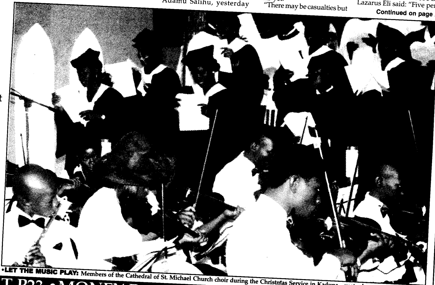
•LET THE MUSIC PLAY: Members of the Cathedral of St. Michael Church choir during the Christmas Service in Kaduna...yesterday