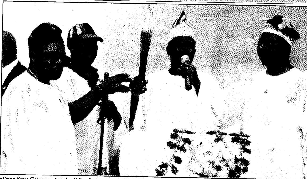
• Ogun State Governor, Senator Ibikunle Amosun, handing over the party symbol to ACN chairmanship candidate in Ijebu Northeast Local Government, Hon. Femi Odunfowokan, at the party's campaign rally in Atan... yesterday. Story on Page 56