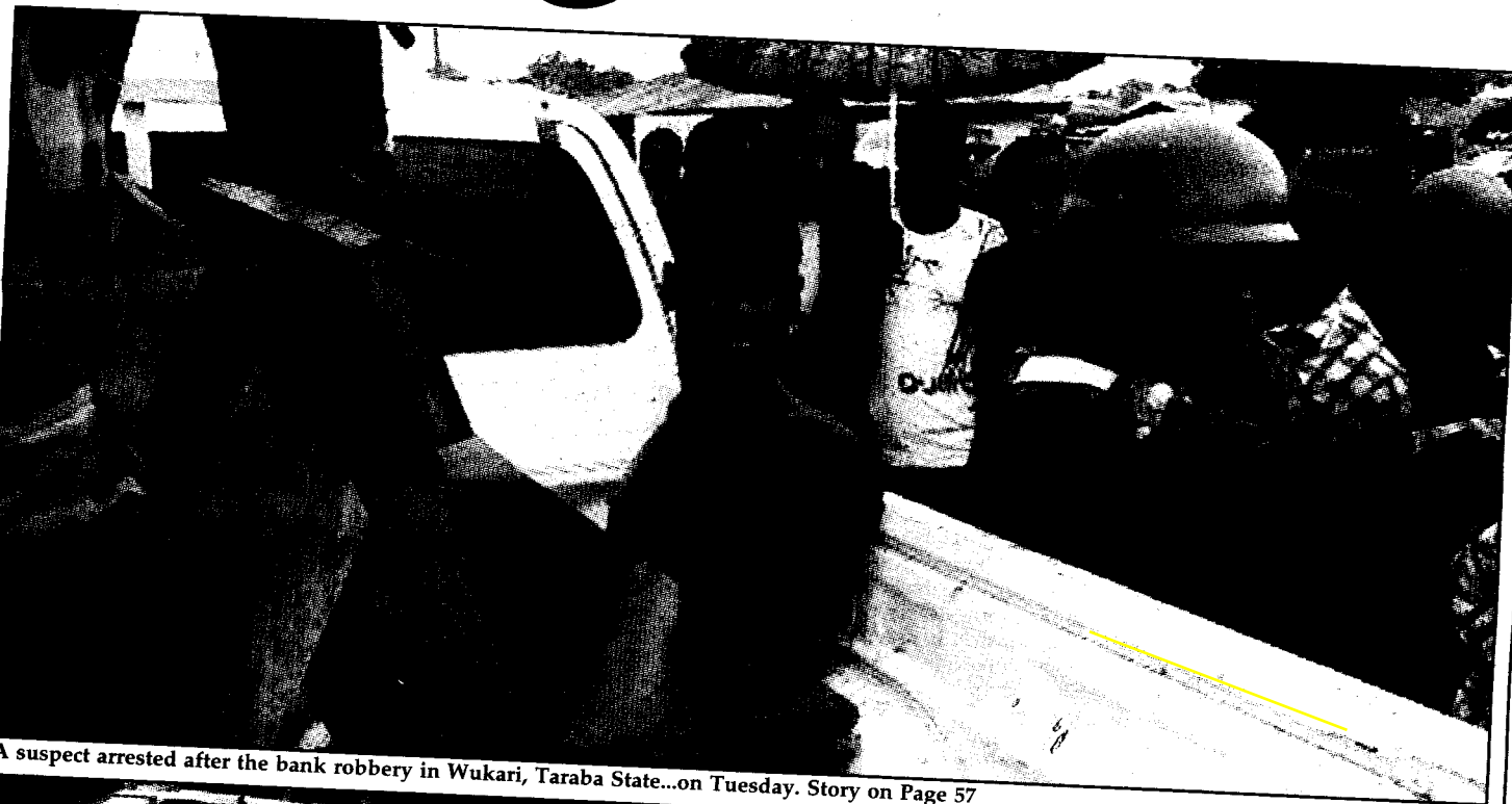
• A suspect arrested after the bank robbery in Wukari, Taraba State...on Tuesday. Story on Page 57