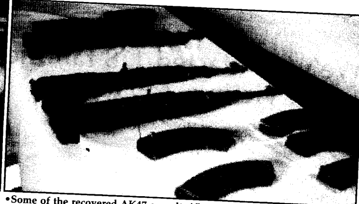
• Some of the recovered AK47 assault rifles from the extremists