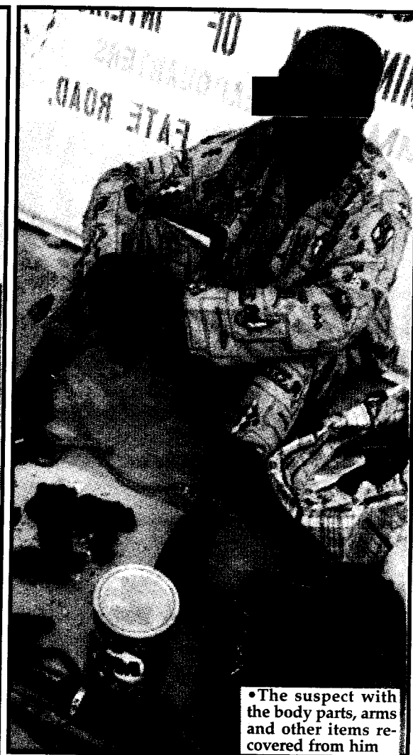
• The suspect with the body parts, arms and other items recovered from him

“We got information from a source that a certain man was selling hemp in a building near the spot where Olalekan's body was found and that people of questionable character usually gathered there... It was during the search that we discovered human parts spread in Abubakar's room like an abattoir”