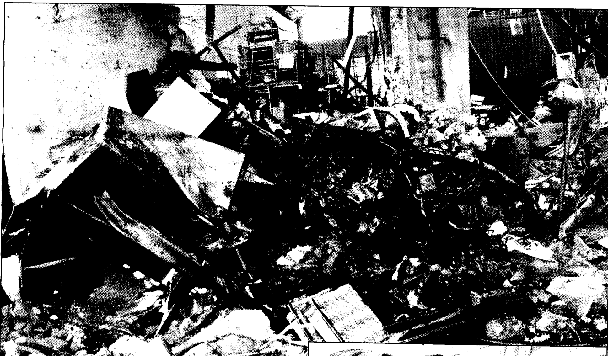
•SCENE OF HORROR: The ThisDay press hall which the SUV rammed into...yesterday