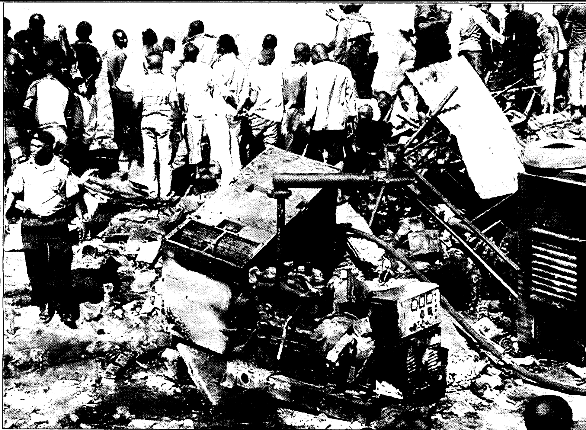
• The scene of the explosion ... yesterday