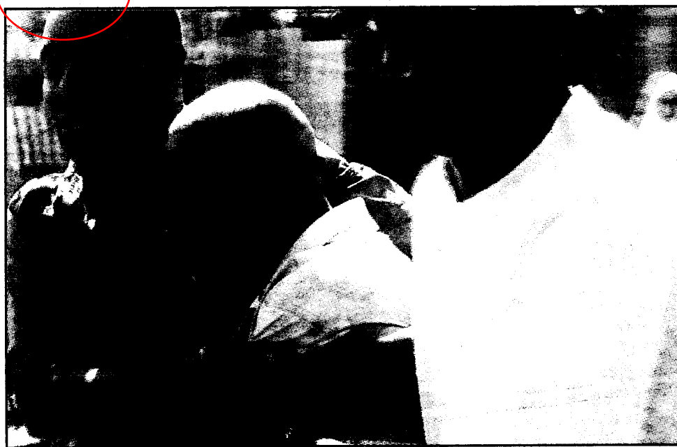
•A man being consoled at the scene of the Kaduna explosion ... yesterday