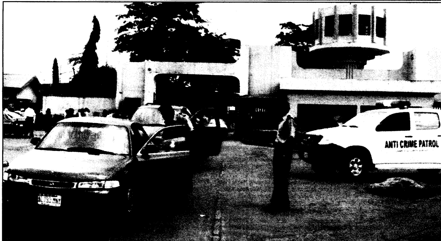
• Security men checking vehicles entering the University of Ibadan (UI) following a bomb scare at the university ... yesterday. Story on page 9.