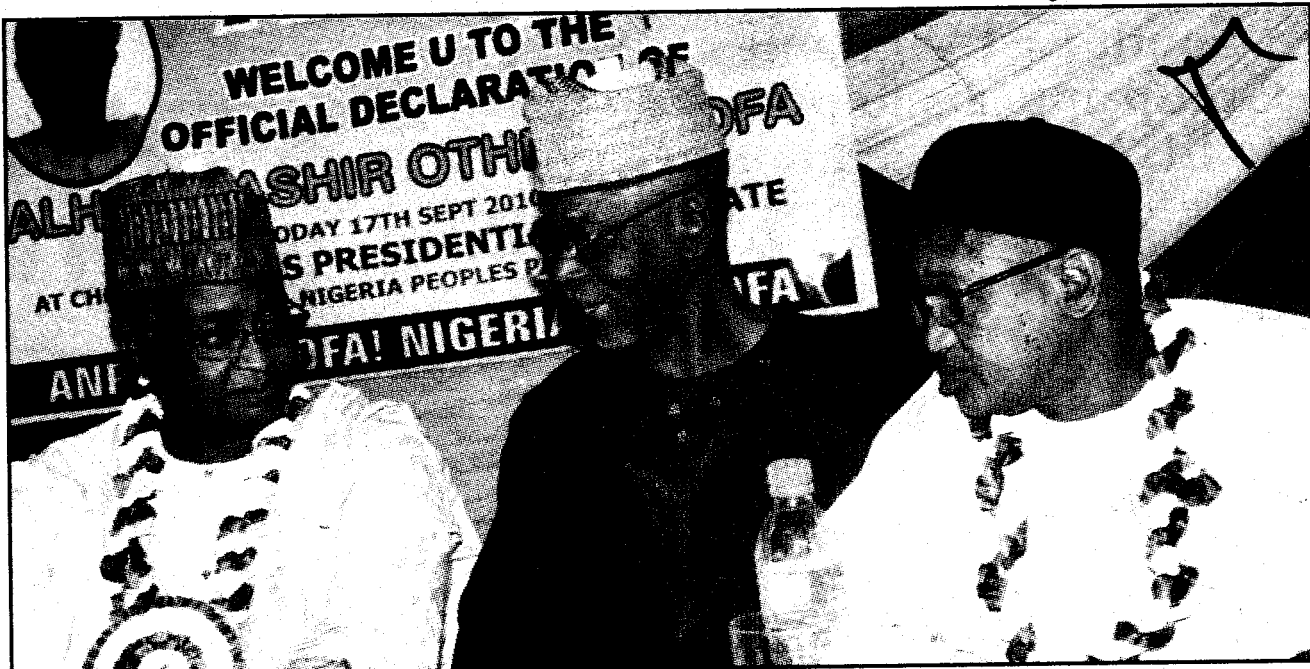
•L-R: Alhaji Bashir Tofa, former Governor of Edo State, Chief John Odigie-Oyegun and former Governor of Yobe State, Senator Bukka Ibrahim at the declaration of Tofa's presidential ambition for 2011 election on ANPP platform at a dinner in Abuja on Friday