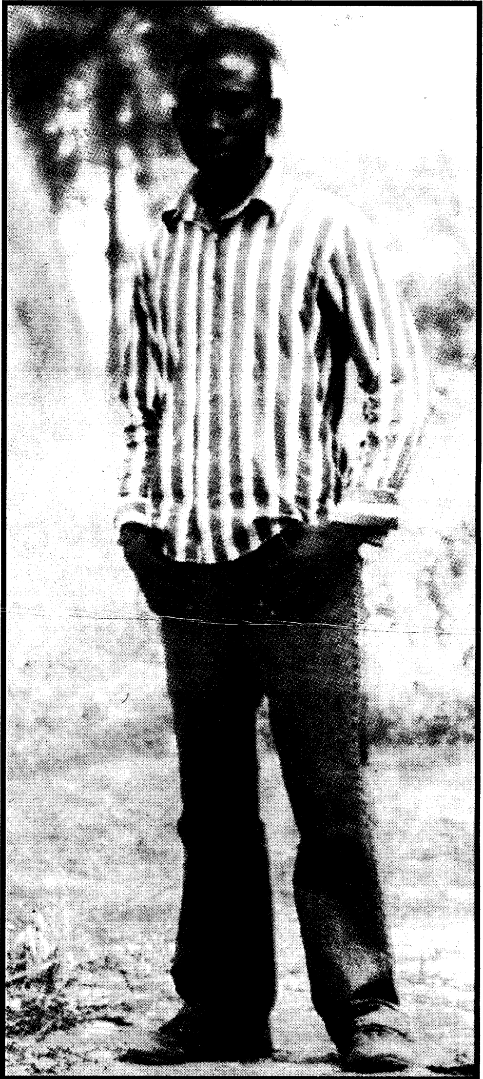
• The late Kingsley ... tall dreams aborted

The petition mentioned names of the members of the gang that attacked the community and asked for their immediate arrest.