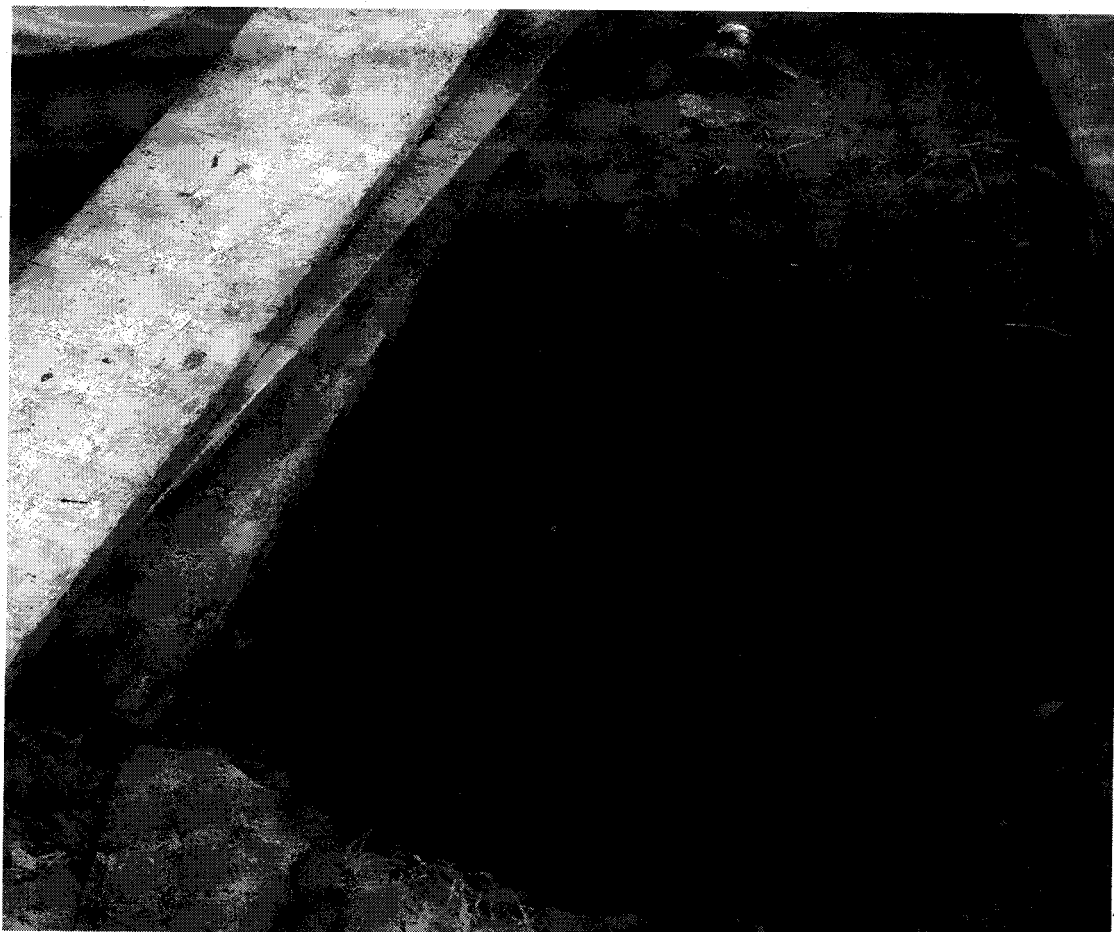
• The well in which the baby was thrown into