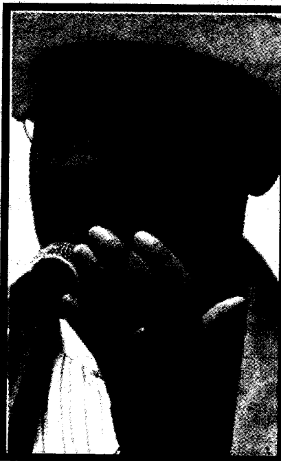
• Governor Omehia

Residents of Aggrey Estate could not sleep as the area came under heavy shooting. At daybreak, the rampaging youths moved onto Aggrey Road and started burning cars while shooting into the air. They also burnt a hotel on Ibeto Cement Road near Recla-