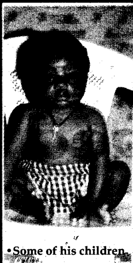
• Some of his children