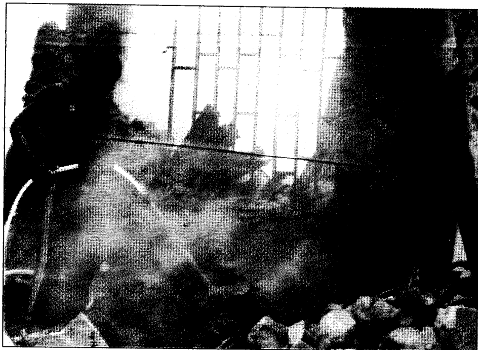
• The burnt building

A FTER a brief lull, robbers returned to Benin City yesterday, with an early morning raid on two new generation banks on Akpakpava Street.