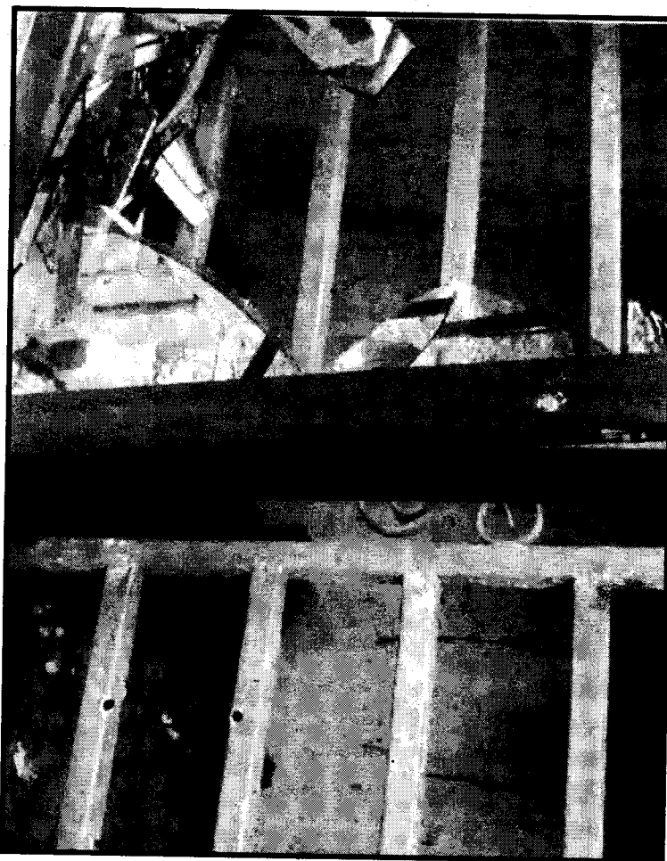
• One of the rooms affected by the gunshots