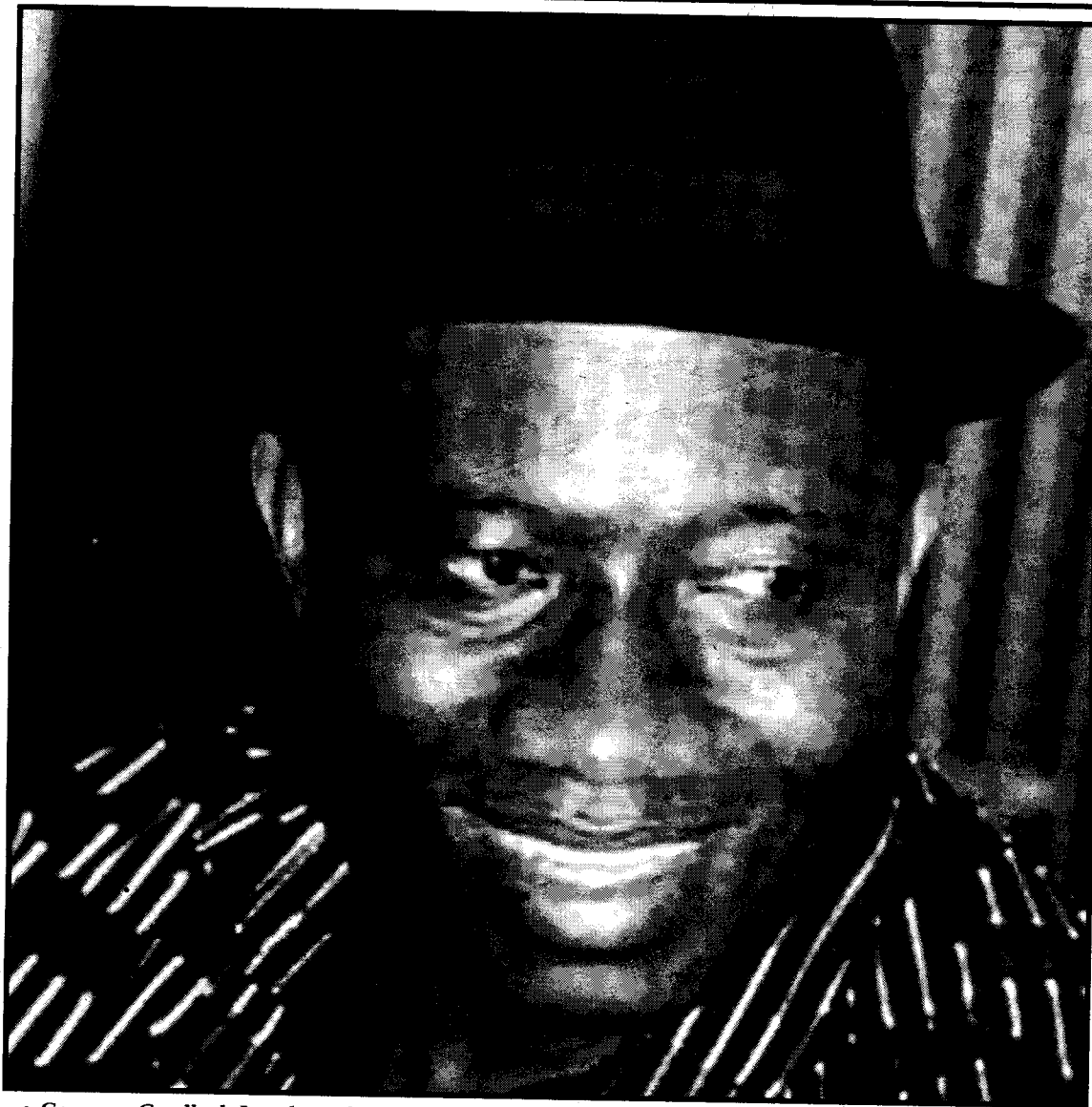
• Governor Goodluck Jonathan of Bayelsa state

She lamented that N80,000 was charged when the mangled bodies were taken to the Federal Medical