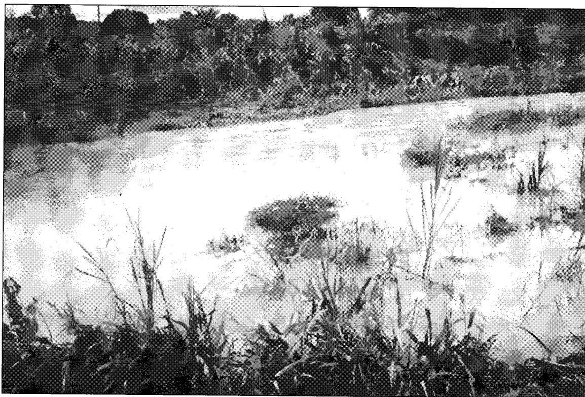
•The river which caused the flood

Ajiboye said the victims were casual workers adding that they