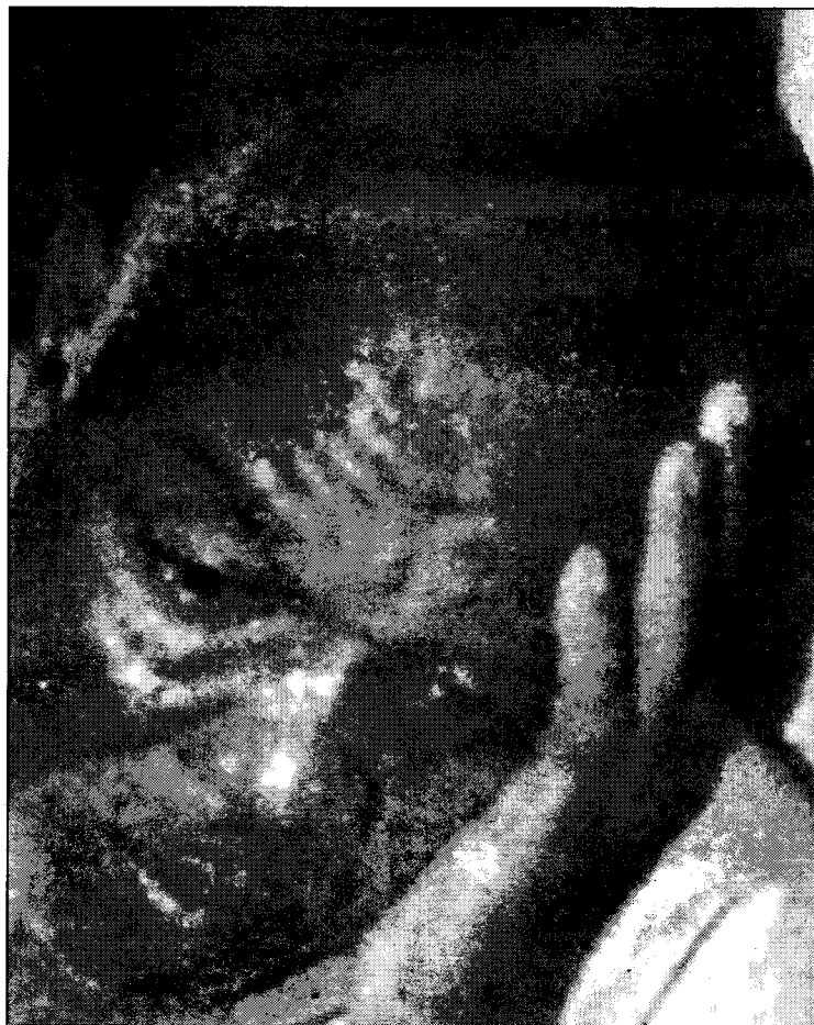
• Chief priest of Ogwugwu

Katsina, added that instead of destruction by people following any provocation, they should go to court to seek re-