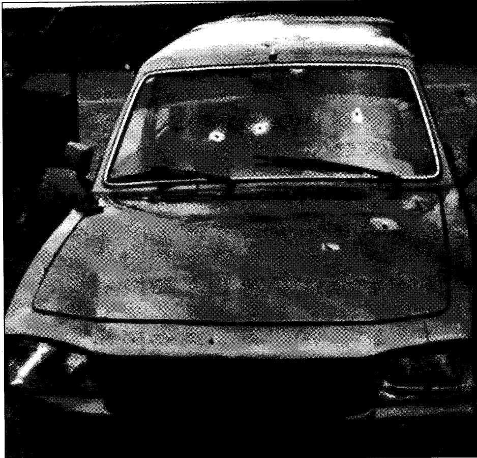
• The Police 504 Station wagon car in which the officer and his men rode with bullet holes