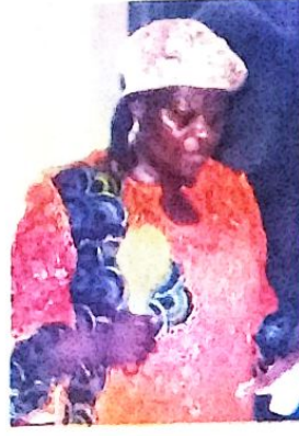
Umukoro (Slain Mother)

A few who spoke exclusively to our correspondent recounted the horrifying events surrounding the death of the victim, popularly called,