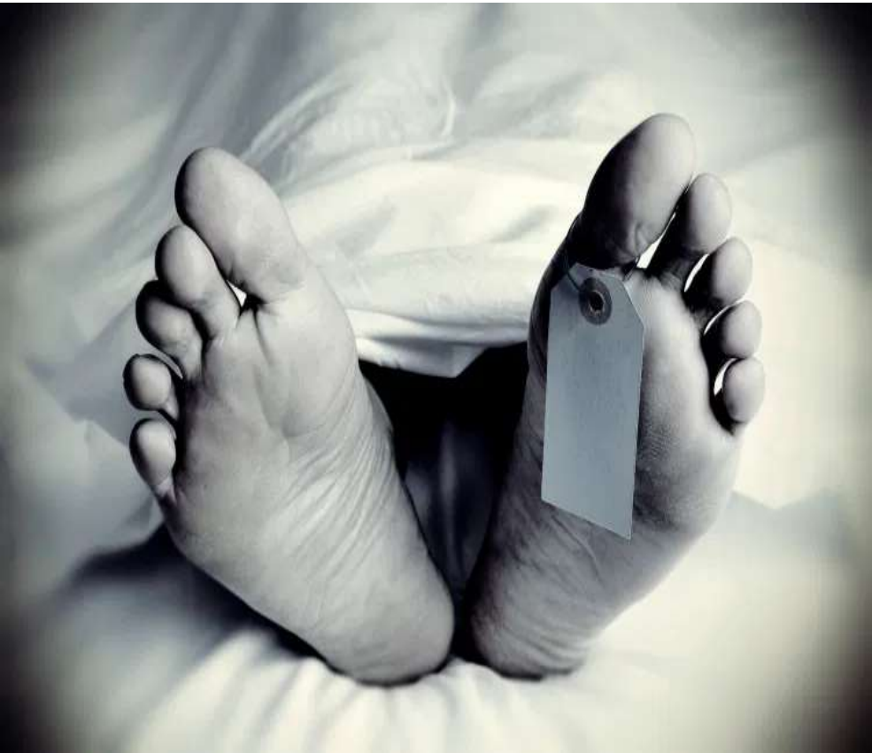
closeup of the feet of a dead body covered with a sheet, with a blank tag tied on the big toe of his left foot, in monochrome, with a vignette added

0 SHARES 0 VIEWS Send Share Share on Facebook Tweet this