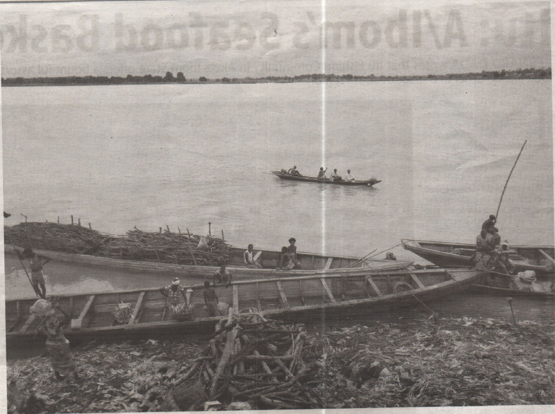
Dugout boats in River Benue