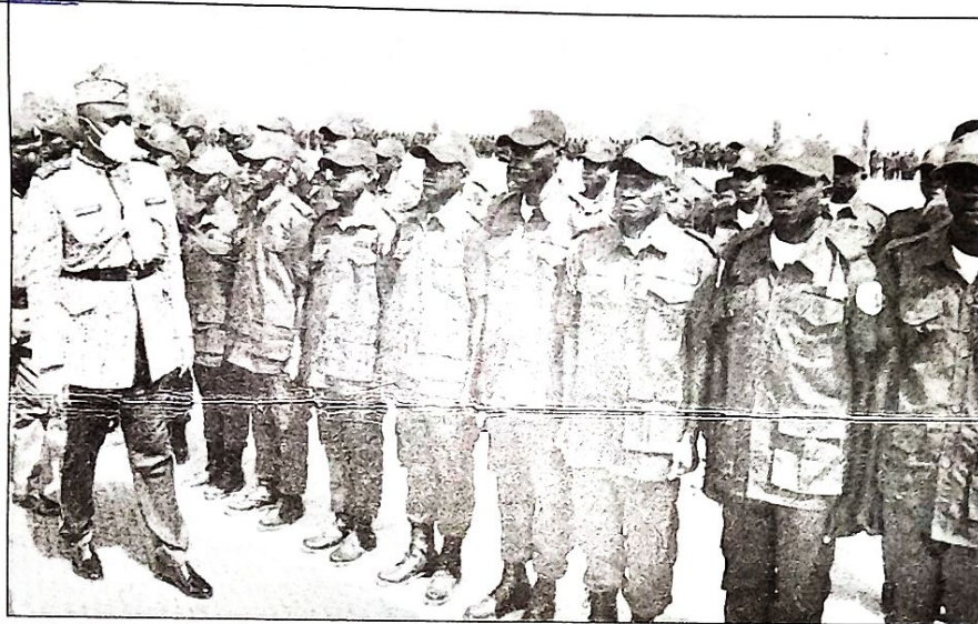
Amotekun with Gov. Makinde

"When my brother was alive, I know the way he used to work at night and come back home in the next morning. He used to save his money with me and out of the token given to him for his service, he used to give my mom little change too. He was very brilliant and has been saving money for his JAMB. He saved the money with me. He has been telling me that he wanted to write JAMB next year. If he was alleged to be a thief, they should have at least arrested him and take him to his school. The Vice-Principal of his school is like a mother to him because of his brilliancy and hard work. She has even promised to adopt him. She was the one that paid for his NECO. She has promised to train him to any level he wished to attain and now they have killed him. They are just complicating the issue for us by saying he was a thief or they're not the one that killed him. They should have come out with