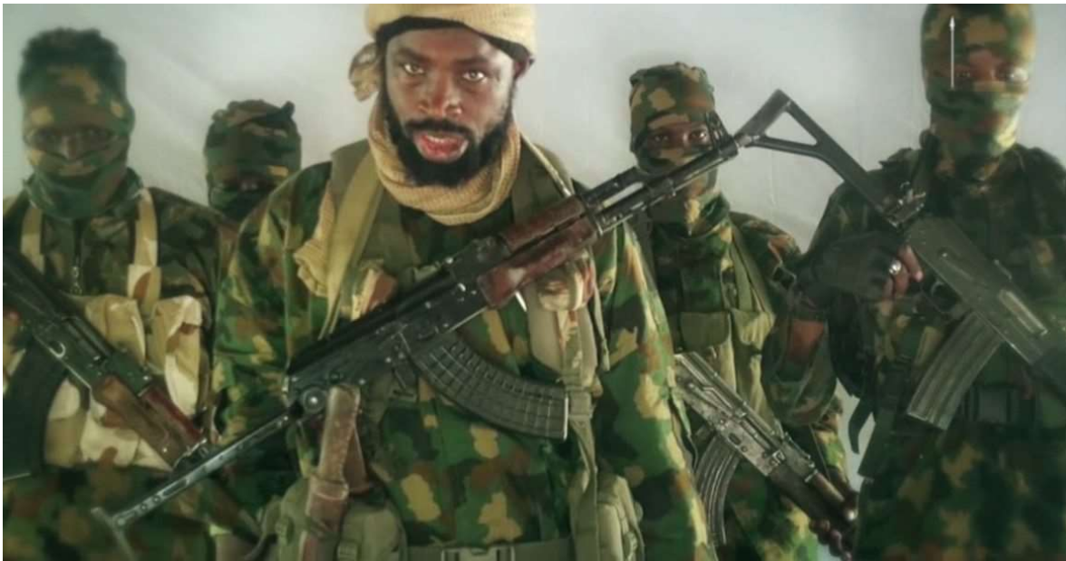
Boko Haram Sect