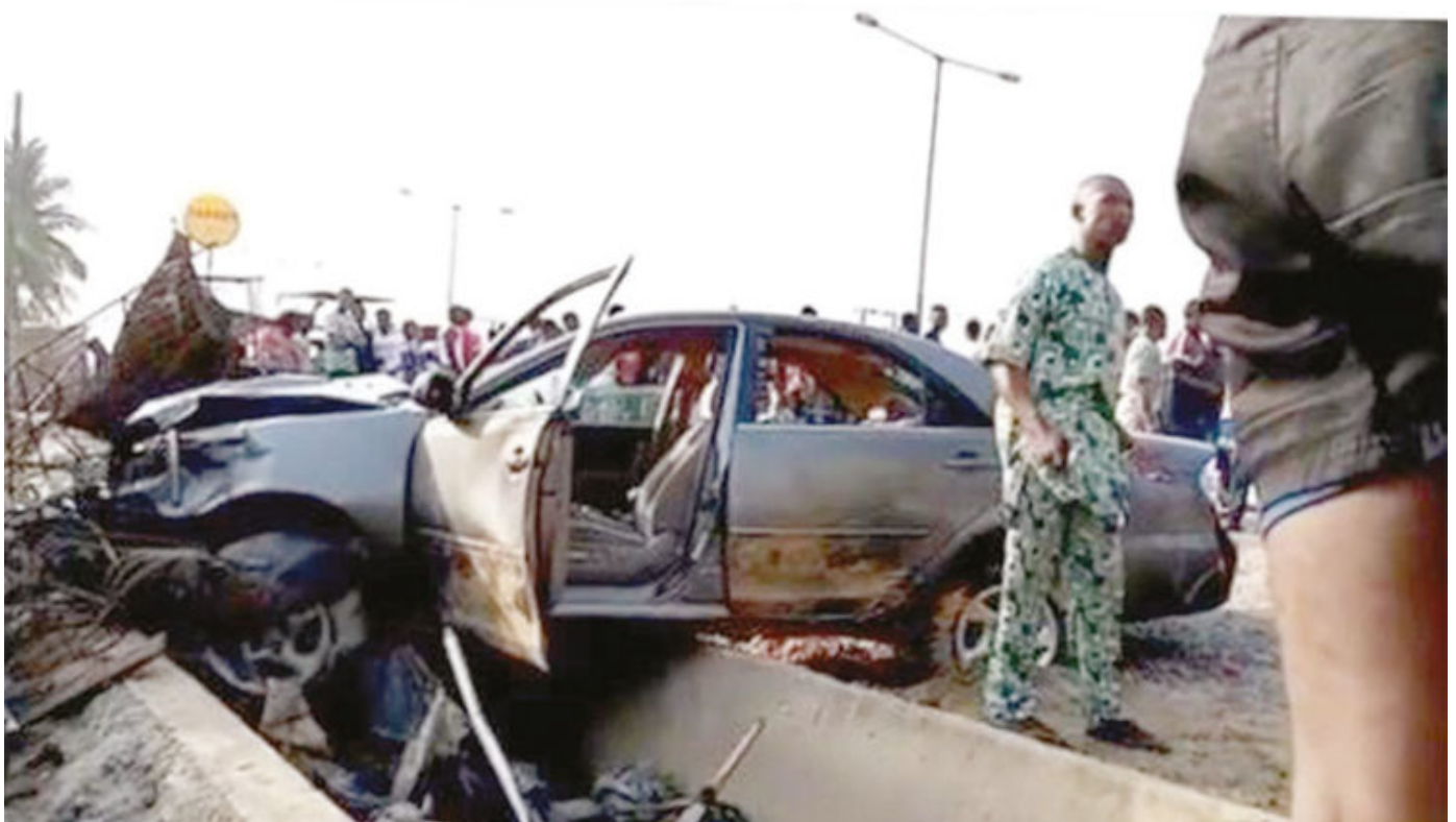
The accident scene