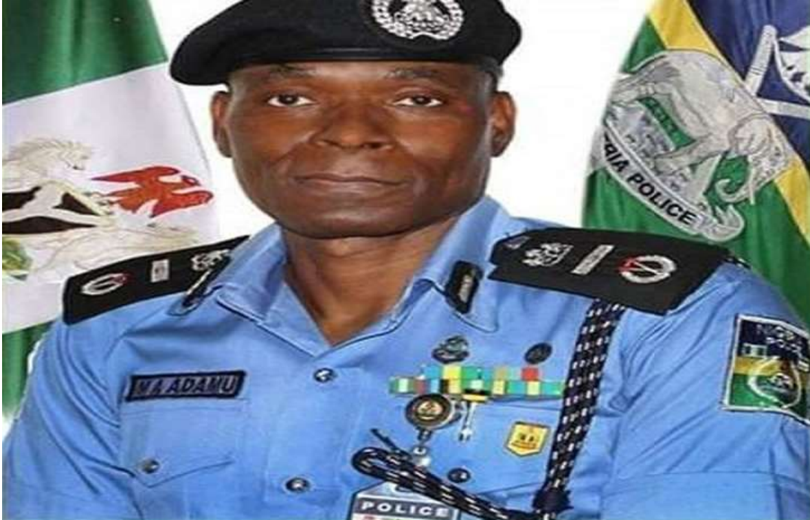
Acting IGP, Abubakar Adamu