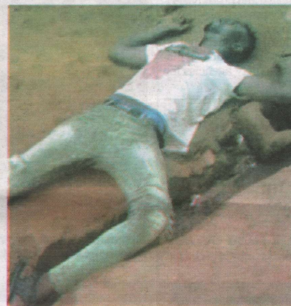
The arrested suspects and those killed

they didn't listen to my explanation, they started beating me and even macheted me," he said.