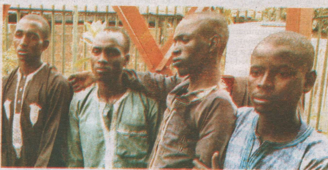
The arrested suspected kidnappers