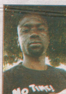
The four IRT Policemen that were killed in Kaduna by the kidnappers