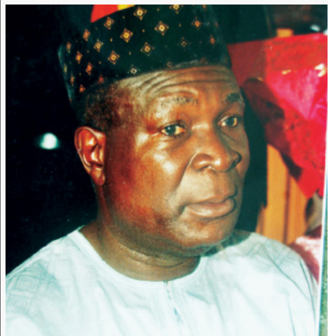
The late Ohanwe