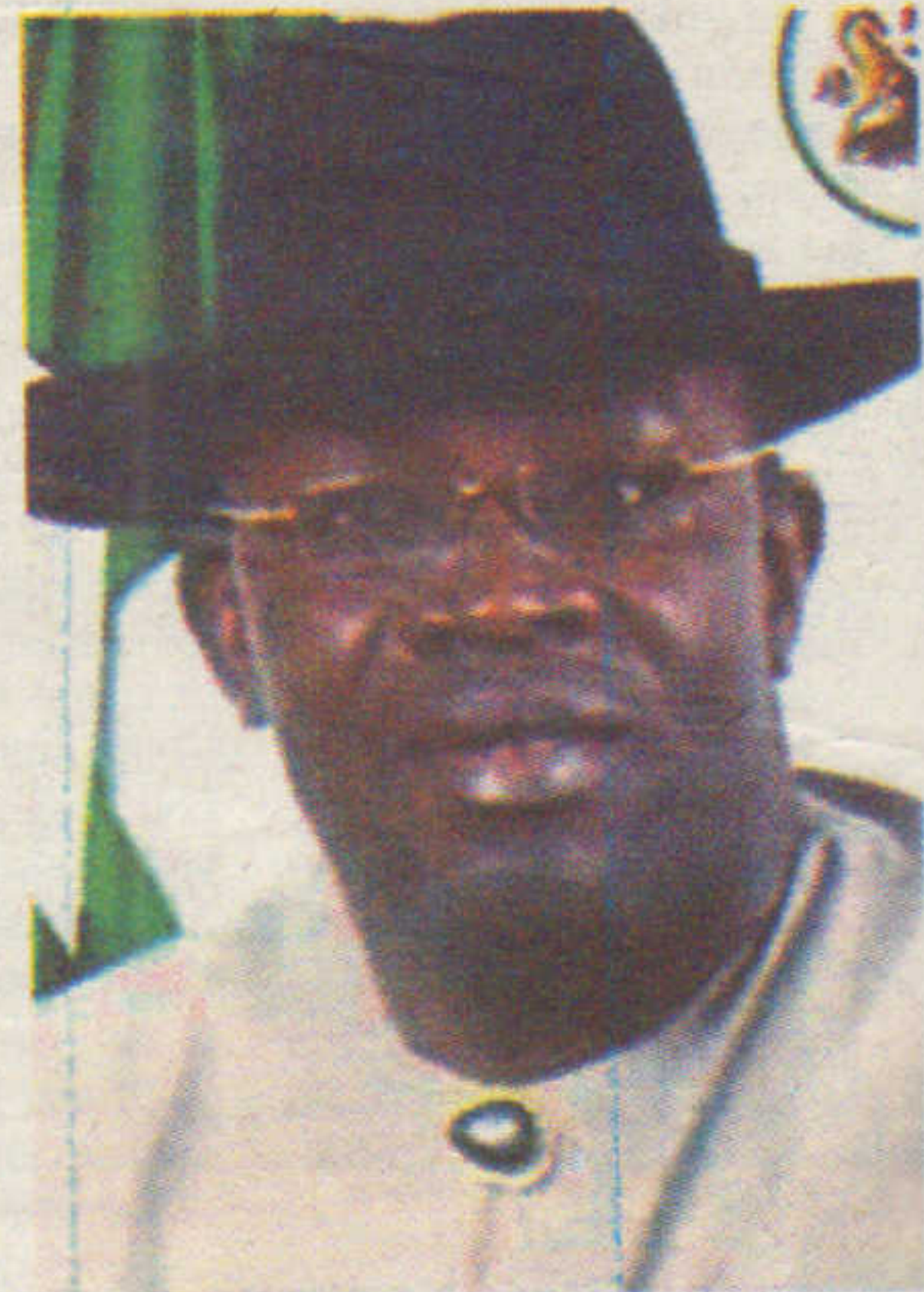
• Seriake Dickson, Bayelsa State Governor.