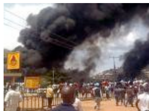
Several Feared Dead in Nigerian Clashes