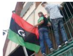
Africa Splits Over Recognizing Libyan Transitional Council