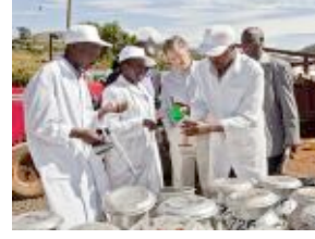
Mobile Technology Unlocks Kenya's Dairy Farming Potential

West Africa Nigeria Conflict Arms and Armies