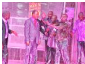
Ugandan Protesters, Besigye Sprayed Pink By Police