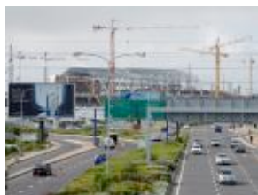
Africa is Ripe for Major New Investment - Experts