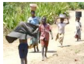
Hospitals Struggle Amid Water Shortage in Malawi