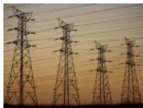
Nigeria's Power Woes to End by 2015 - President