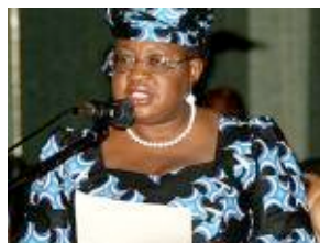
Nigeria's New Finance Minister Sworn In