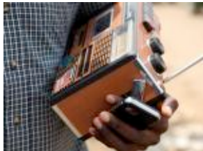
Global Technology Firms Gear Up for Push into Africa