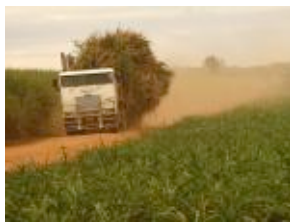
Swaziland's First Science Policy Taking Shape

Créez un compte ou connectez-vous pour voir ce que vos amis recommandent.