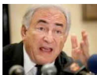
African 'Victims' of Ex-IMF Head Urged to Come Forward