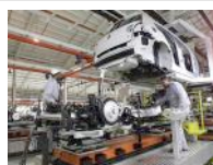
New Report Calls for Trade Diversification in Africa