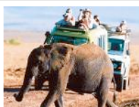
Online Tourism on the Rise in Africa