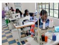
China Begins to Look Away From Africa