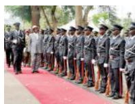
Museveni Tolerates Corruption, Graft - Opposition