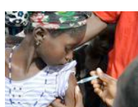
Meningitis Vaccine Could Save 140,000 African Lives