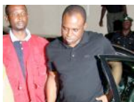
Outgoing Nigerian Speaker Arrested