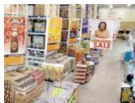
Walmart Gets Nod to Merge With South African Retailer