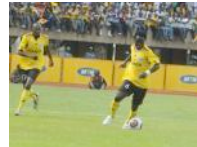
Soccer Shocks for Egypt, Nigeria at Africa Cup of Nations

Freeway incident, travel times, and lane closure information www.ie511.org/traffic