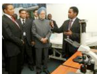
India Joins China In Seeking African Business