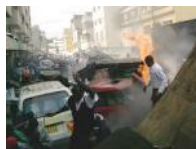
Deadly Explosion Hits Nairobi