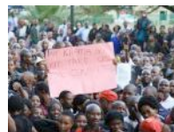
Botswana's Public Servants' Strike in its Second Month