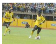
Soccer Shocks for Egypt, Nigeria at Africa Cup of Nations