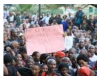
Botswana's Public Servants' Strike in its Second Month