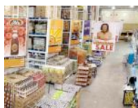
Walmart Gets Nod to Merge With South African Retailer