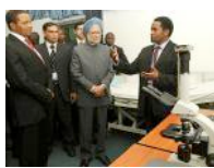
India Joins China In Seeking African Business