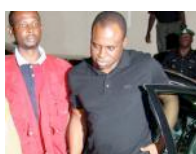
Outgoing Nigerian Speaker Arrested