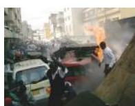
Deadly Explosion Hits Nairobi