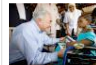
International Monetary Fund's Managing Director Dominique Strauss-Kahn (L) accepts a...