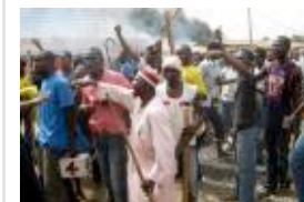
Nigeria Gears Up for Post-election Tribunal