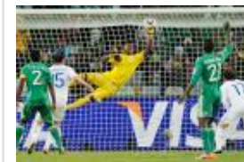
Argentina Names 'Killer' Squad for Nigeria