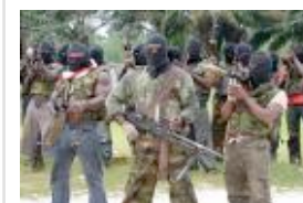
Nigeria: Ex-Militant Leader in Govt House?