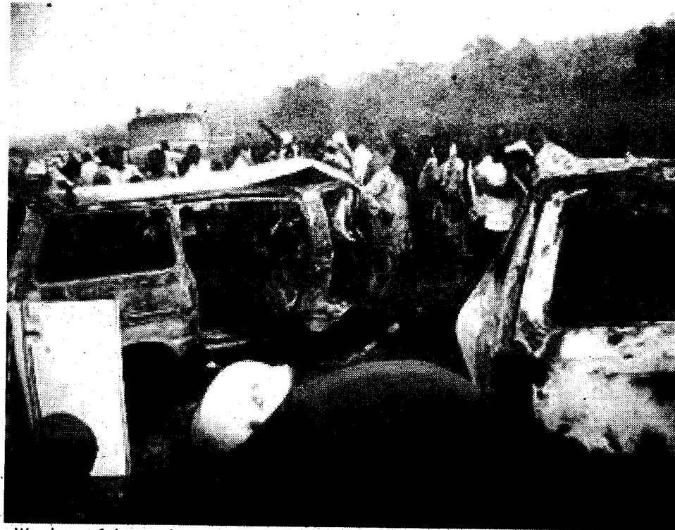
•Wreckage of the two buses