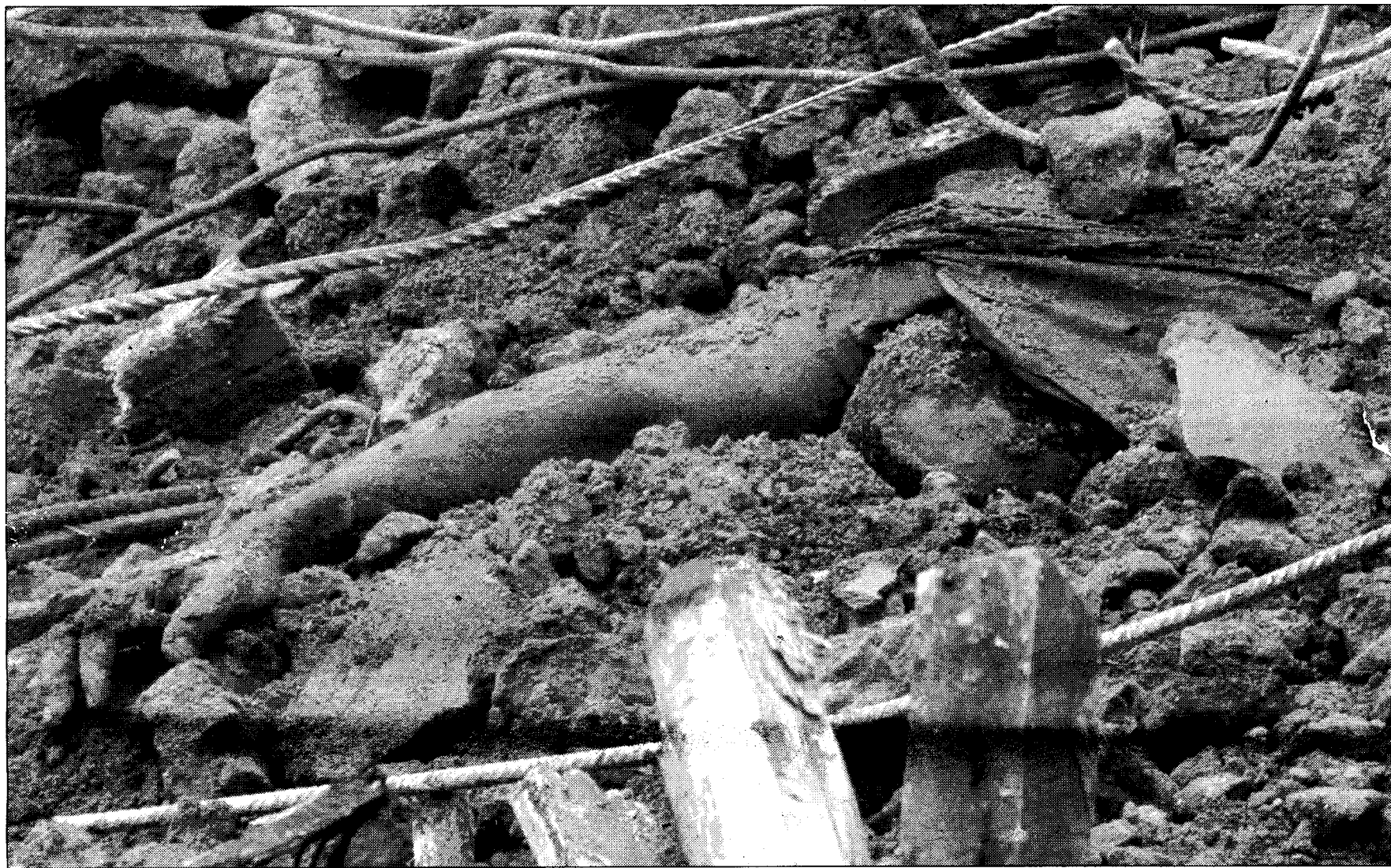
• A victim trapped in the rubble