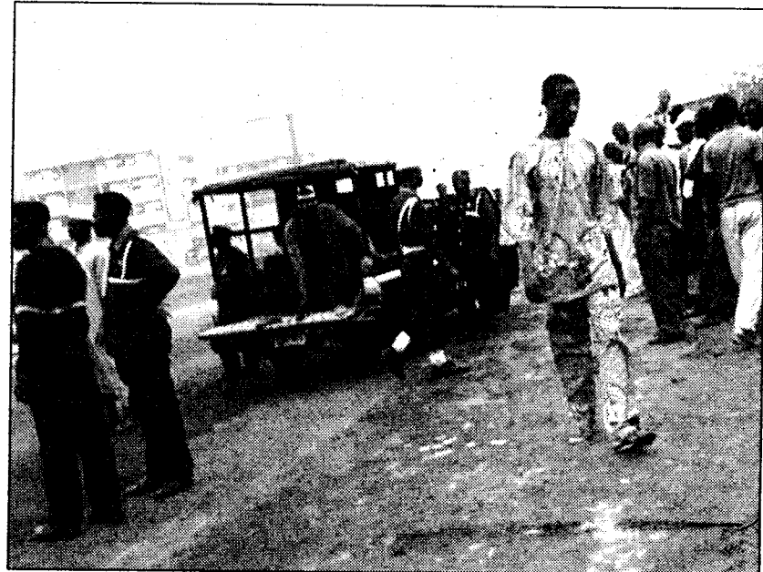
• Security operatives at the scene of the fire

Reports have it that the traffic jam has led to occasional scuffles between commercial bus drivers and the truck drivers while hapless car owners continue to call on government to provide alternative routes and parking space for the tankers.