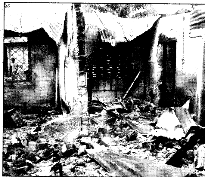
• Another burnt house