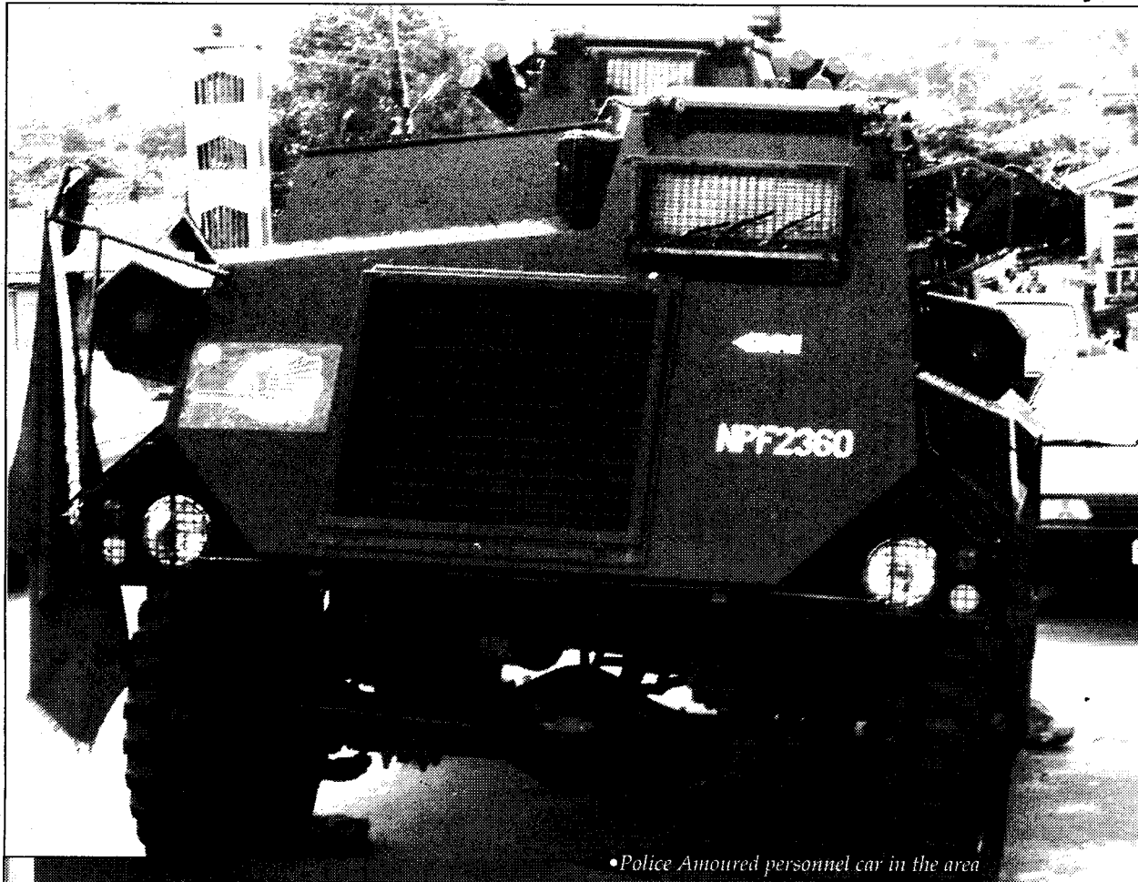
• Police Armoured personnel car in the area