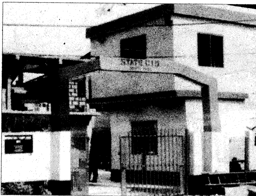
• State CID, Pantti, Yaba